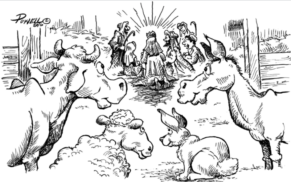
A gift that still shines bright...